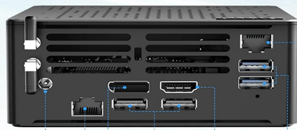
DC IN RJ45 Lan DP 1.2 2xUSB 2.0 HDMI 2.0 2xUSB 3.0 RJ45 Lan